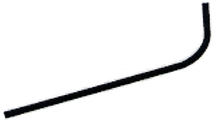
Reverse Bullnose (roof slope down)